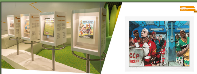
Original drawings on display at FIFA Museum in Zurich, Switzerland