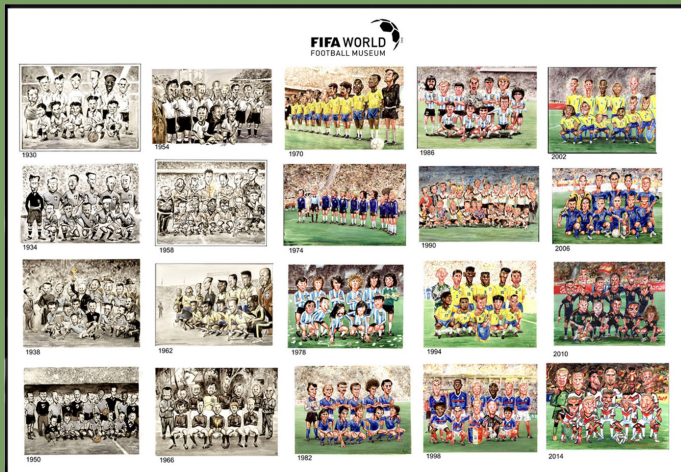
Drawings acknowledged and appreciated by FIFA Museum in Zurich, Switzerland