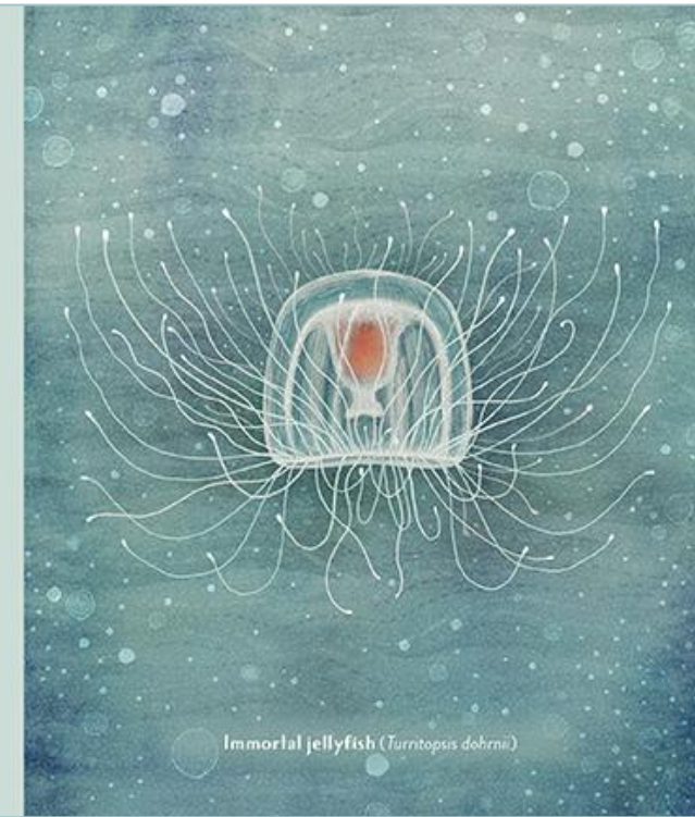
Immortal jellyfish ( Turritopsis dohrnii )