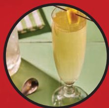
DRINK French 75-ish