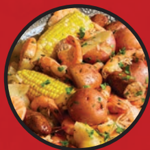
MAIN Indoor Shrimp Boil