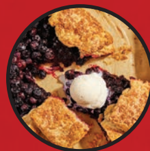
DESSERT Blueberry Lime Galette