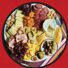
APPETIZER The Platter